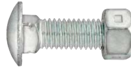
With Lock Nuts

Round Polished Stainless Steel Capped Heads Zinc Plated