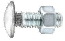
With Hex Nuts